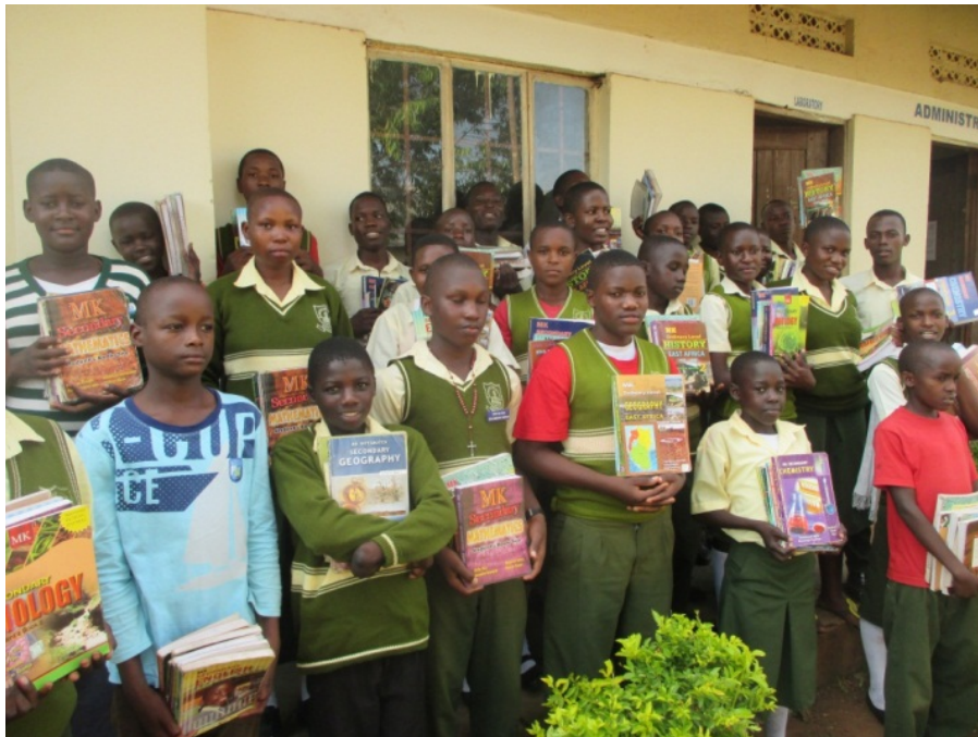
Liahona High School students with their text books.