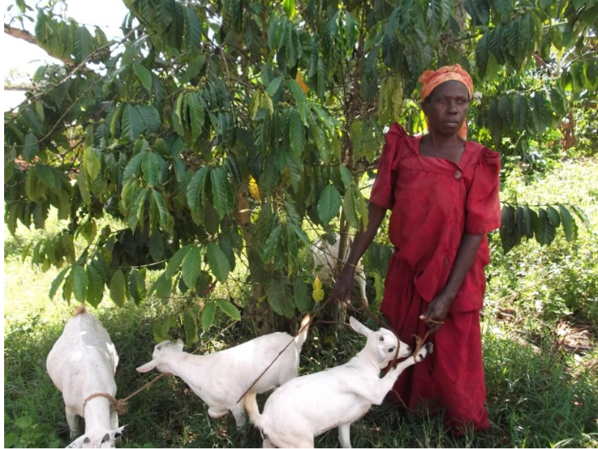
A progressing woman with her goats