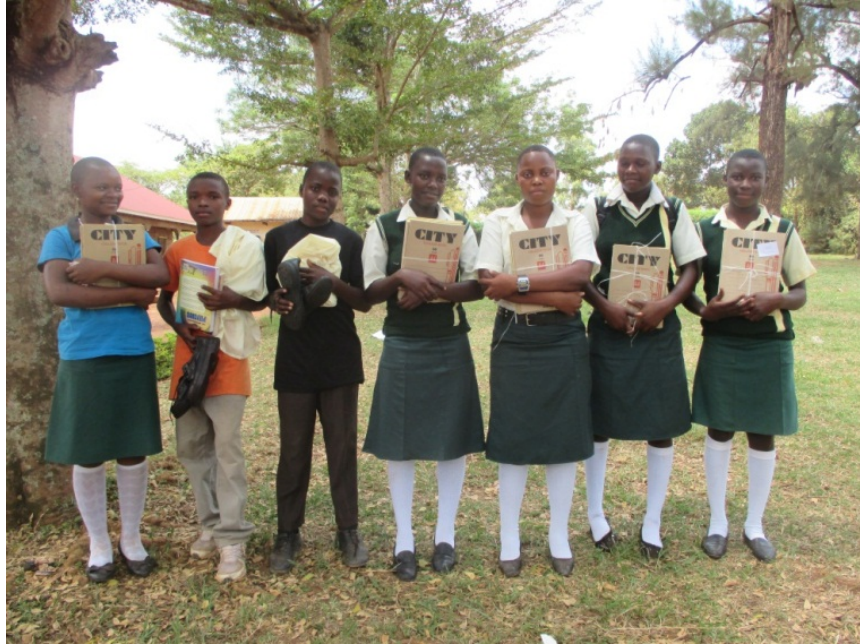
St. Lwanga Secondary School students with their exercise books.