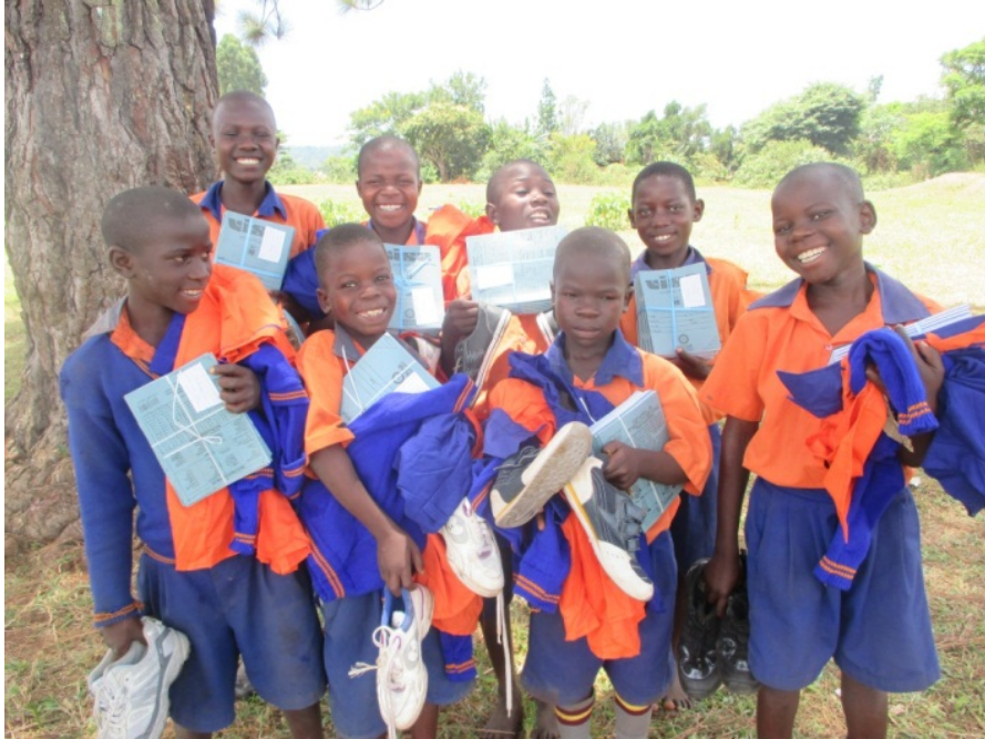
Kanonko Parents Primary school pupils happy with their shoes, uniforms and exercise books.