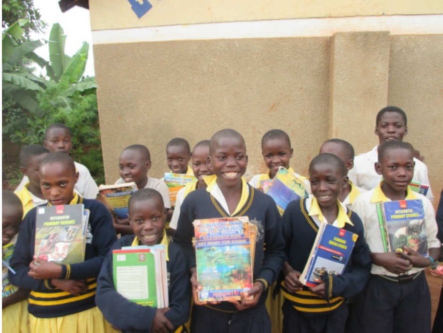
Lugasa Parents Primary school pupils happy with their text books