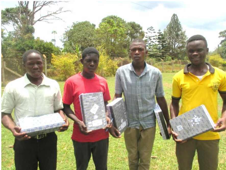
St. Lwanga Malongwe Technical students with their black books.