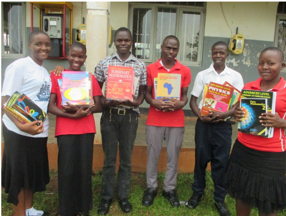
St. Joseph's Namagunga High School Advanced level Students after receiving text books