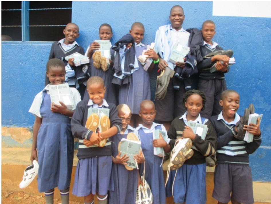
God's Angel Primary School pupils happy with their school needs.