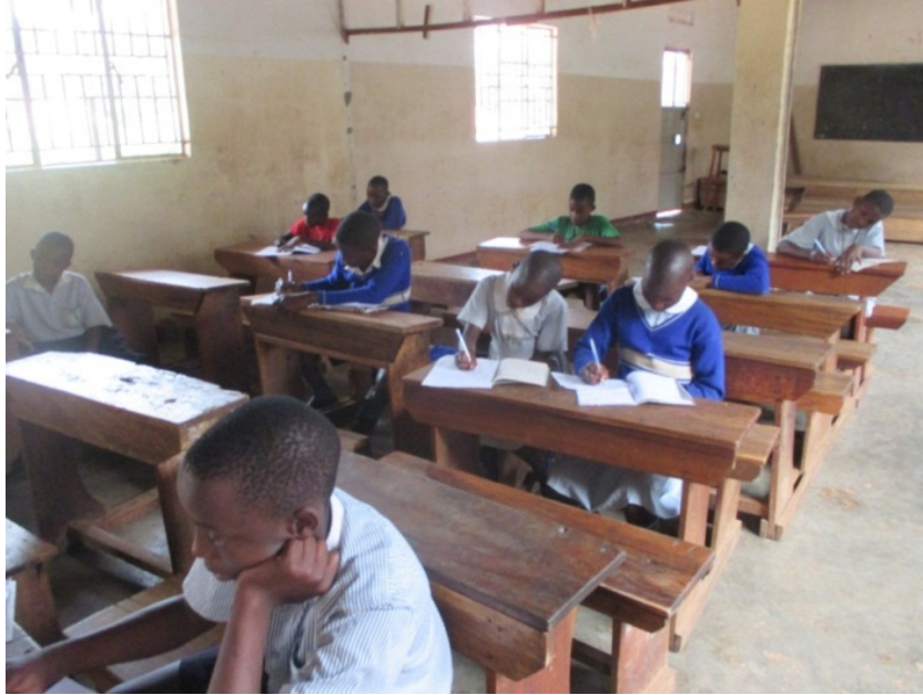
Victor's Junior School Pupils writing end of year letters to their sponsors.

Kanonko Parents Primary school two permanent classrooms were constructed during the year. Grateful and thanks goes to TRUE Africa Sponsors.