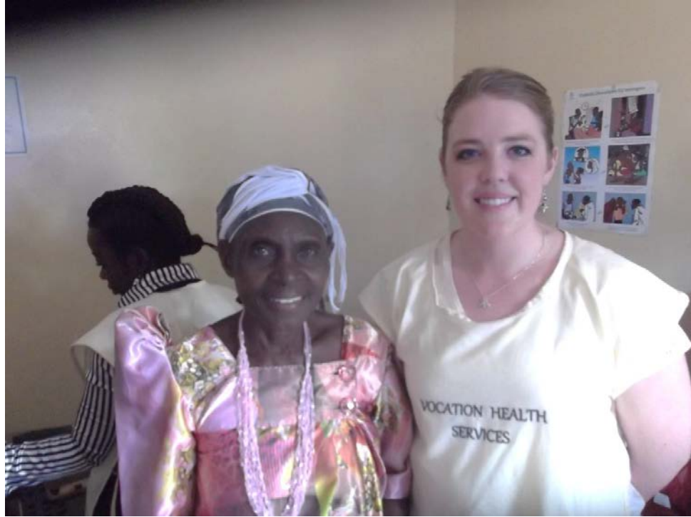
In both photos, medical volunteers with patients