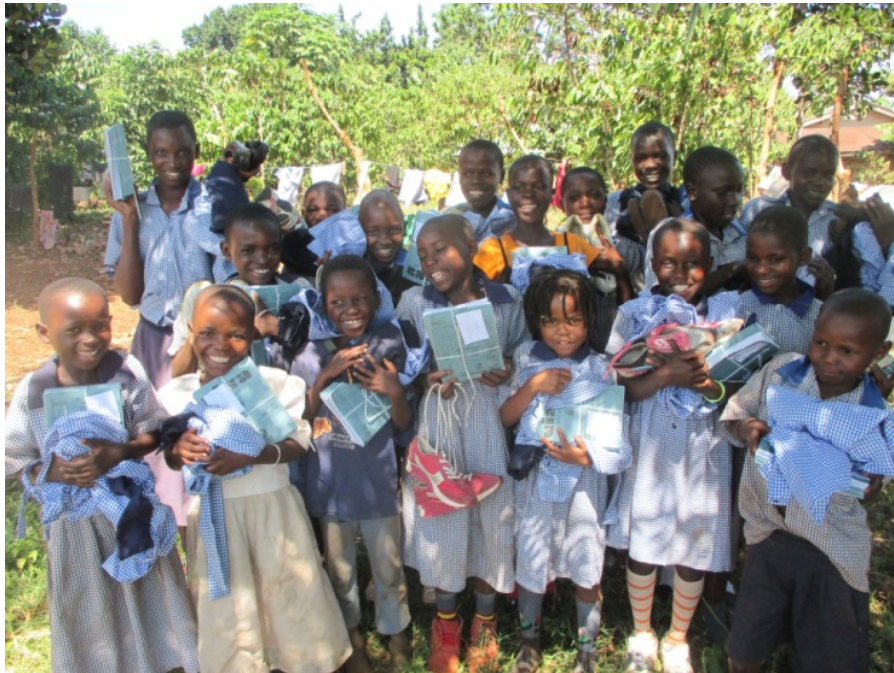
Buyomba Community Academy Primary school pupils happy with their scholastic materials.