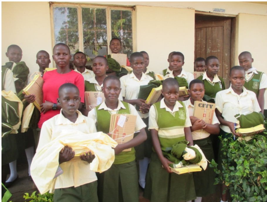
Liahona High School students with their exercise books and school uniforms.