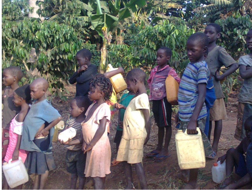
Children ready to fetch water from the constructed water source

iii) HEALTH: Sisters of St. Joseph Clinic, Kyambogo: During the year, Out Patients Department (OPD) received 2,657 patients, 41 mothers came for Antenatal care and 16 delivery cases were registered. Most cases received were those having malaria, Arthritis, Ulcers, and respiratory tract infections.