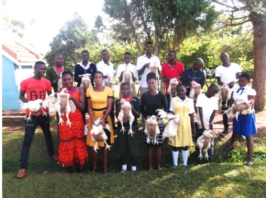
Another group with their chicken as a Christmas gift