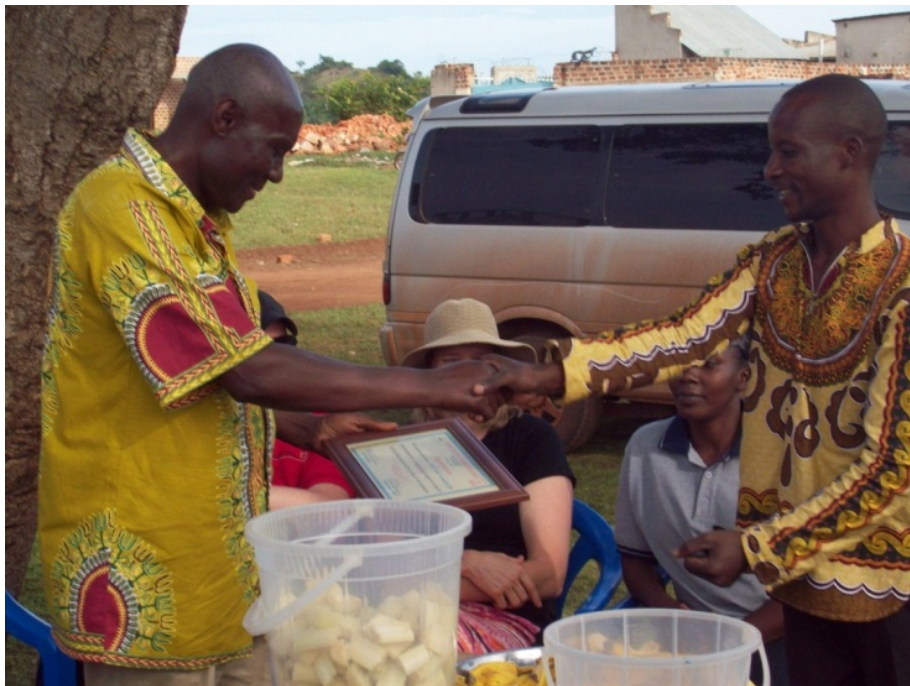
Director (Foundation) receiving C2Y certificate of appreciation from the Headmaster.