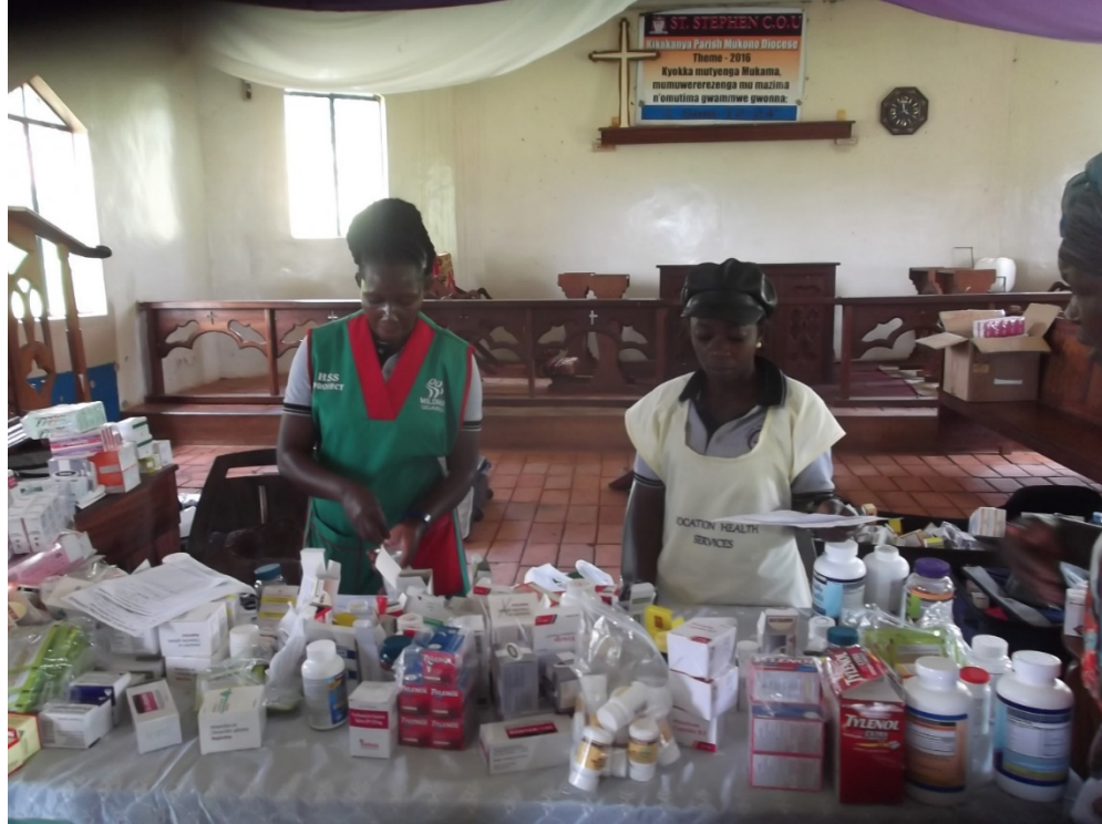
In both photos, the donated medicine by the medical Volunteers