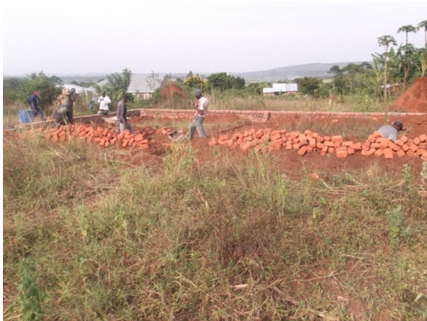
The two classrooms foundation construction

Kanonko Parents Primary school two permanent classrooms were constructed during the year. Grateful and thanks goes to TRUE Africa Sponsors.