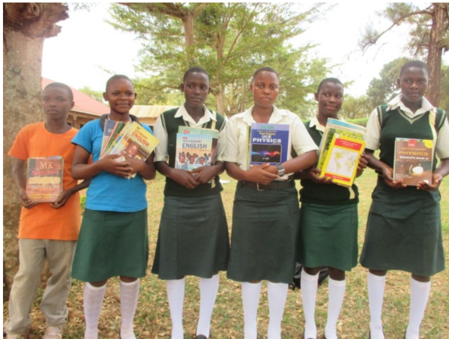
St. Lwanga Secondary School students with their text books.