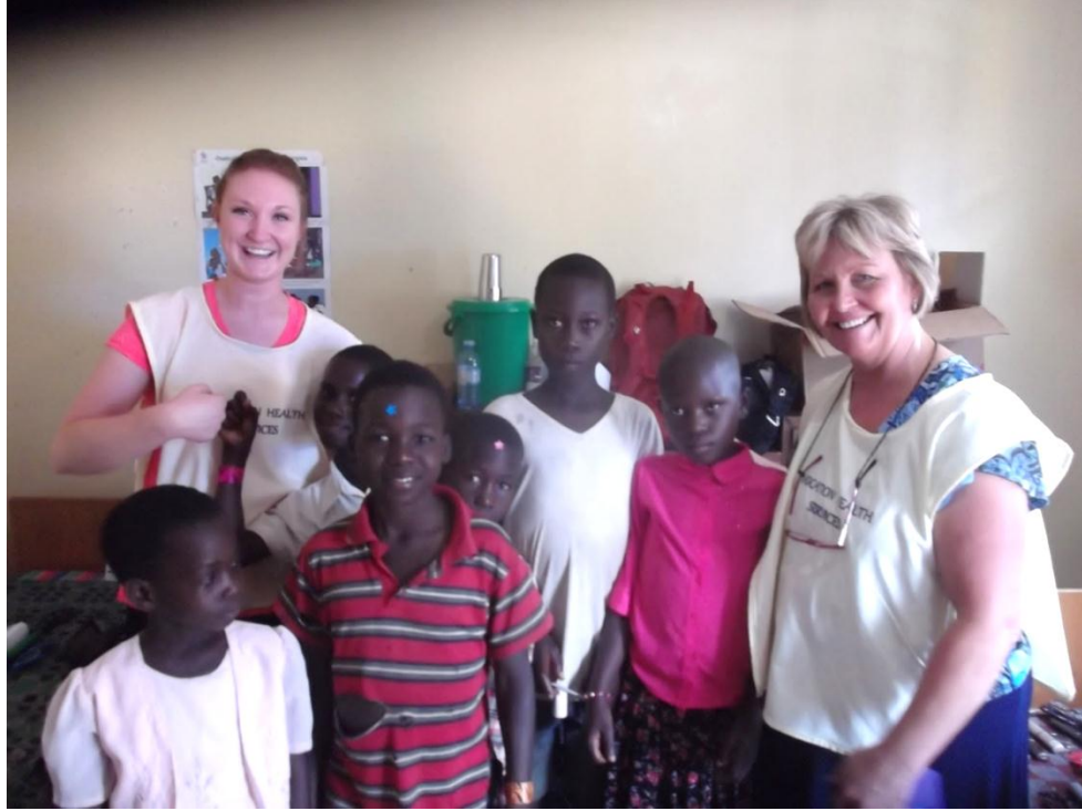
Medical Volunteers happy to be with children in one of the camps