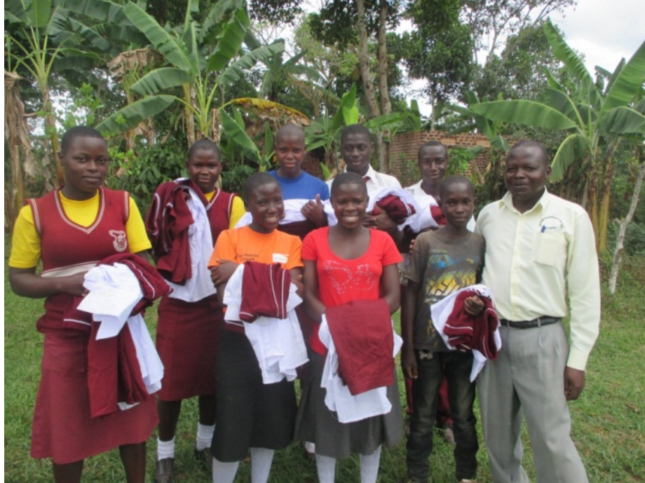
Najja Educational Centre sponsored students with their uniforms.

We thank God that most of the children were promoted to next classes though we had some few who repeated classes. Children also wrote end of year letters to their sponsors wishing them happy Christmas and New Year-2017 and thanking the sponsors for their financial and materials contribution towards their education and wellbeing in 2016.