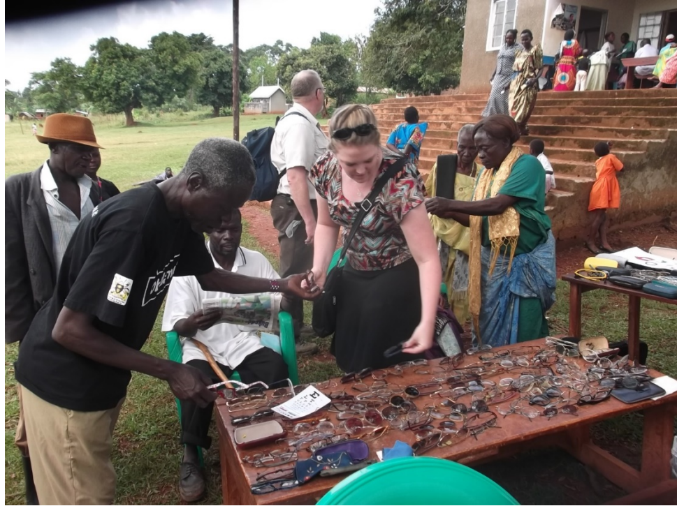
A display of reading glasses