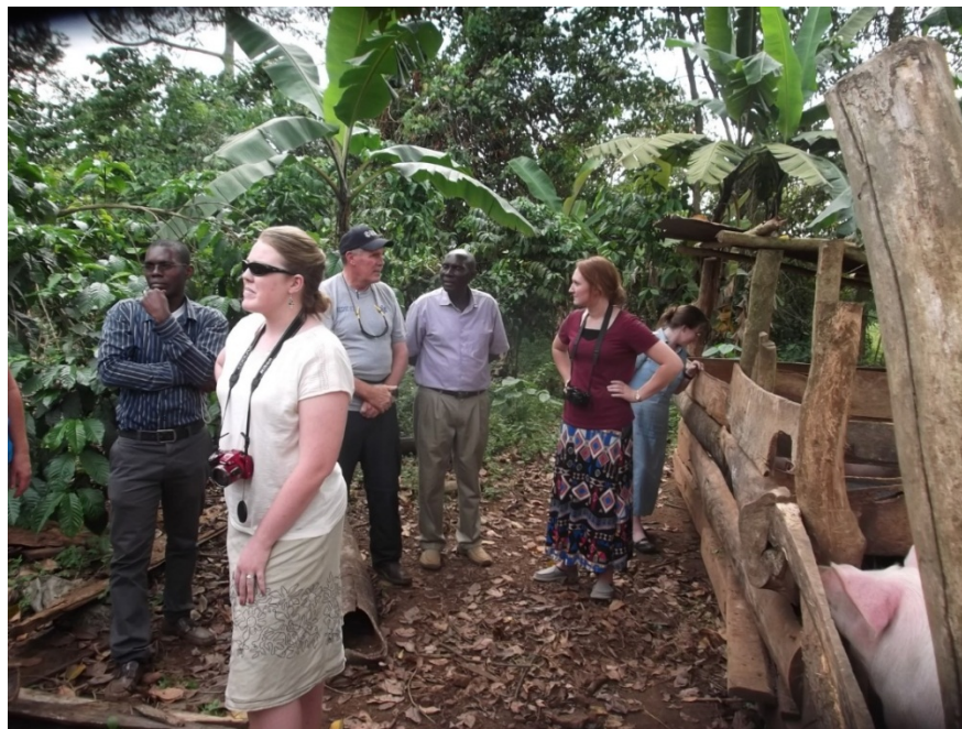
Visitors from US to the Foundation visiting one of the piggery project