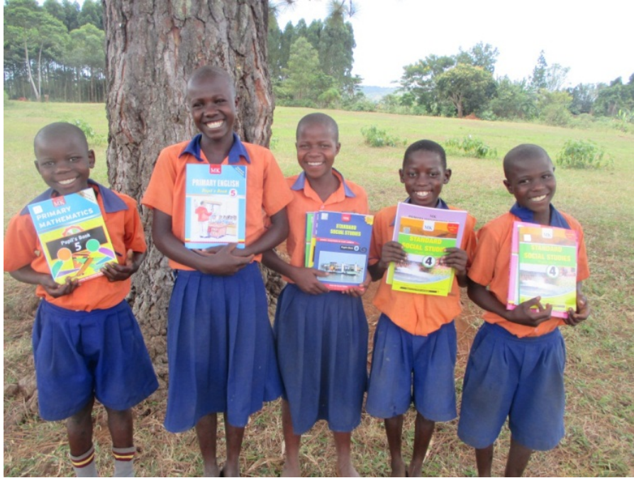
Kanonko Parents Primary school pupils happy with text books.