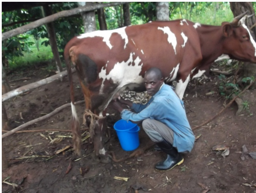
A farmer milking a cow