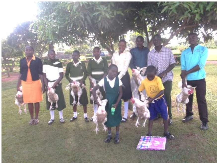
Some children with their Christmas gift of chicken.