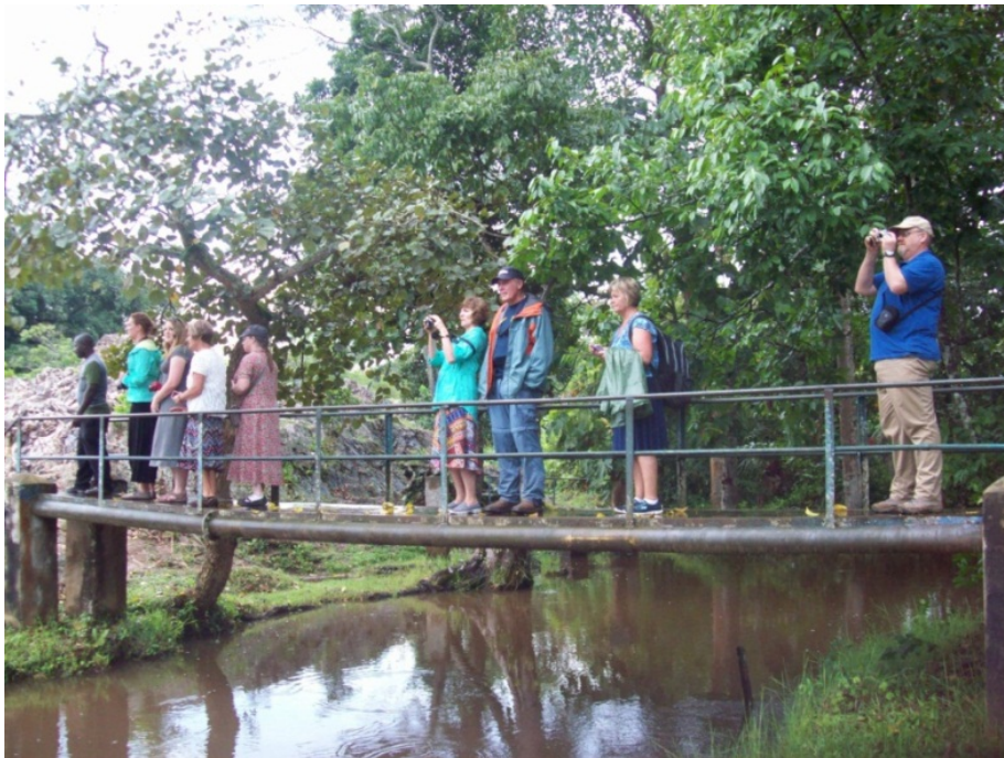
Some of the visitors at Sezibwa falls.