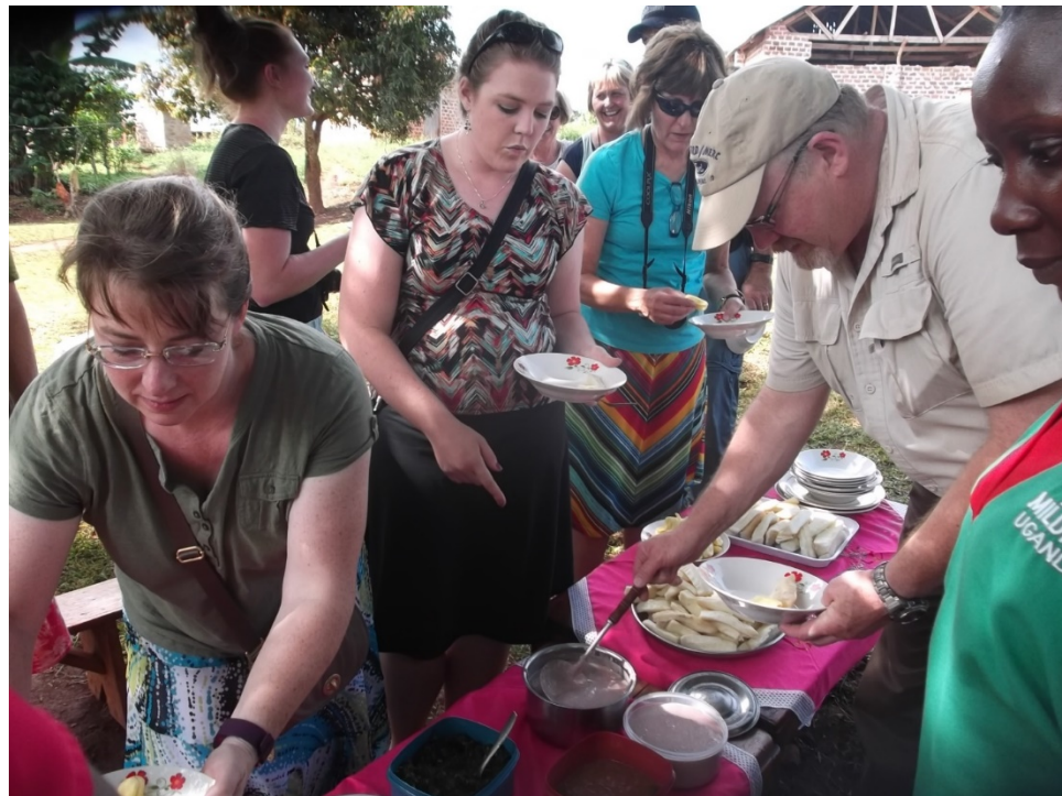
The medical Volunteers receiving lunch prepared by community members