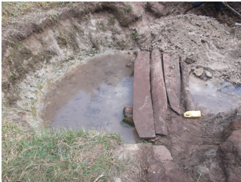
Kazansaya village water source before its construction

In addition to the 12 spring wells which were constructed in the past, the thirteenth well was constructed at Kazansaya for the village and two primary schools.