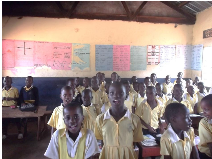
Happy and optimistic sponsored children singing