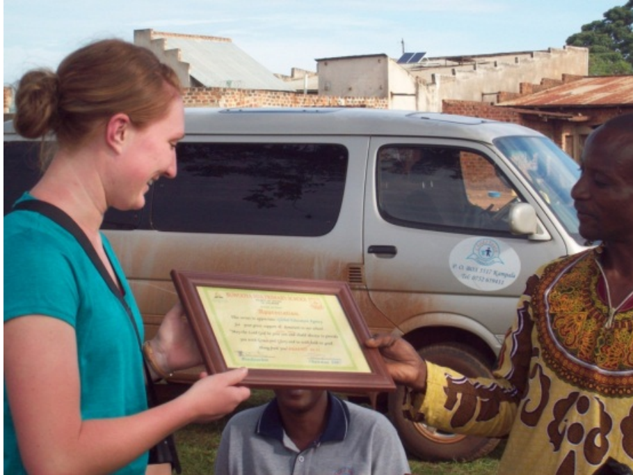
The Idaho team leader at the handing over receiving GEA certificate of appreciation from the Headmaster