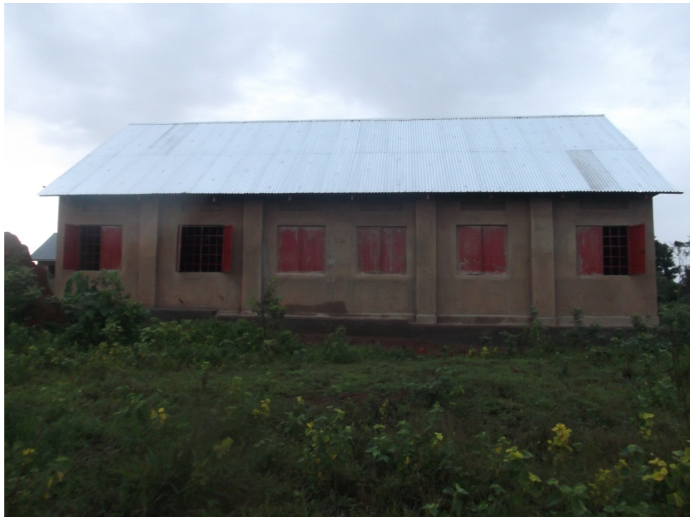
The behind part of the completed two classrooms.