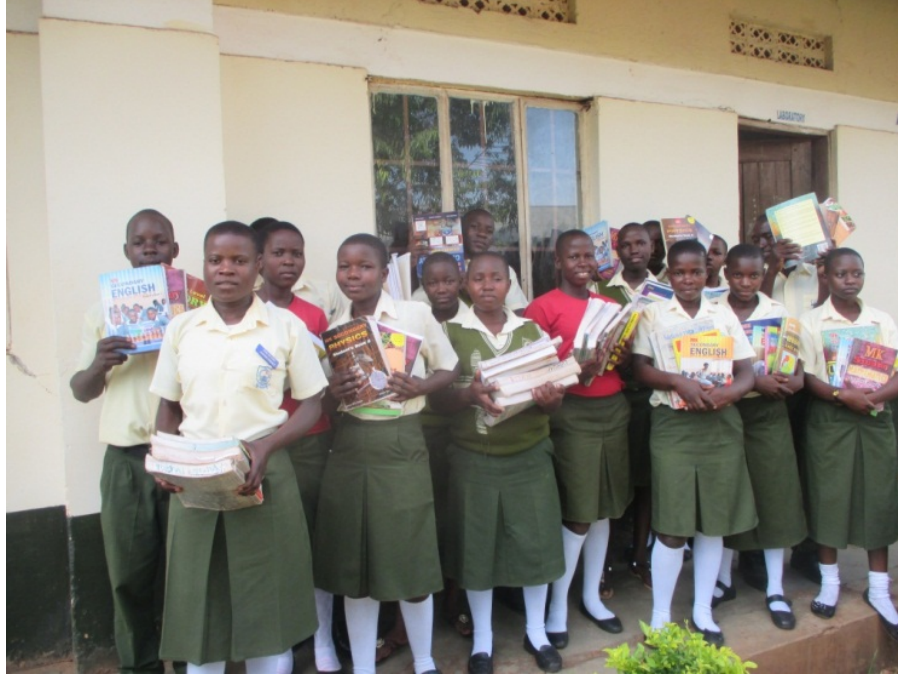
Liahona High School Students very happy with their text books