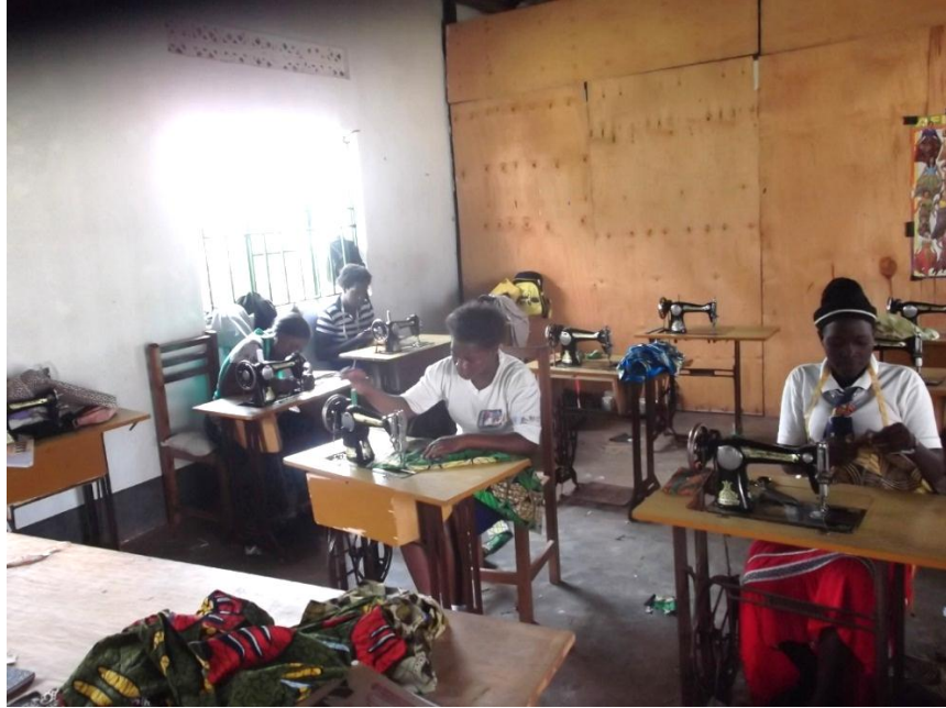
Kyambogo Community and Kikakanya women were also given sewing machines