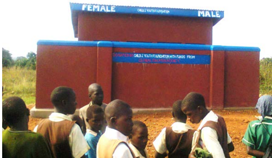
The Lined pit latrine which was handed over.