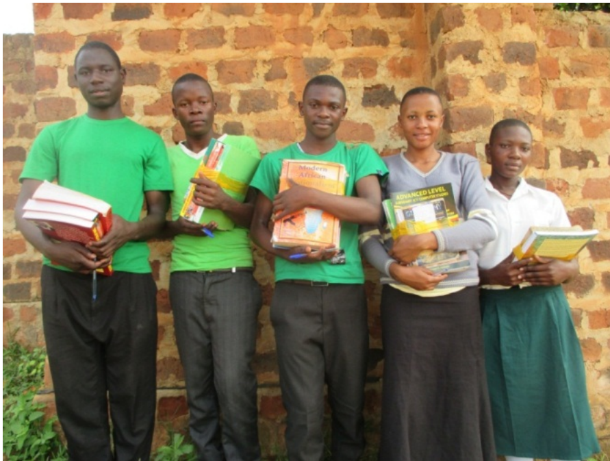
Light College students with their text books.