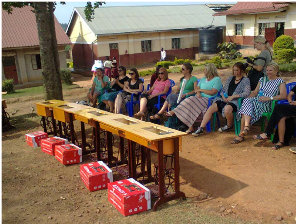
Also St. Maria Goretti Girls Vocational Training Centre received a donation of five sewing machines to boost the training of tailoring skills.