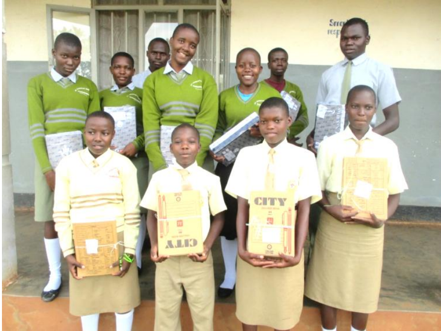
St. Josephs Namagunga High School students with their exercise books.