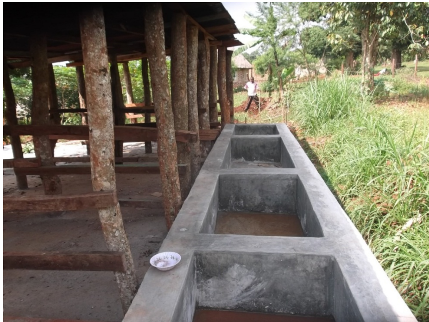
A modern cow structure for zero grazing