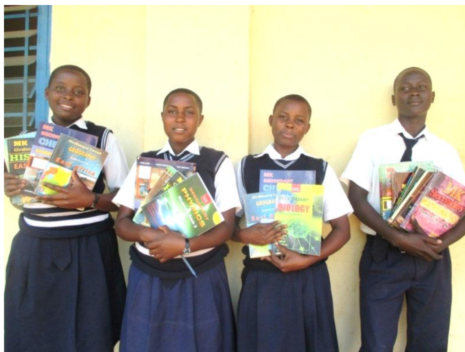
St. Andrews Secondary School students with their text books