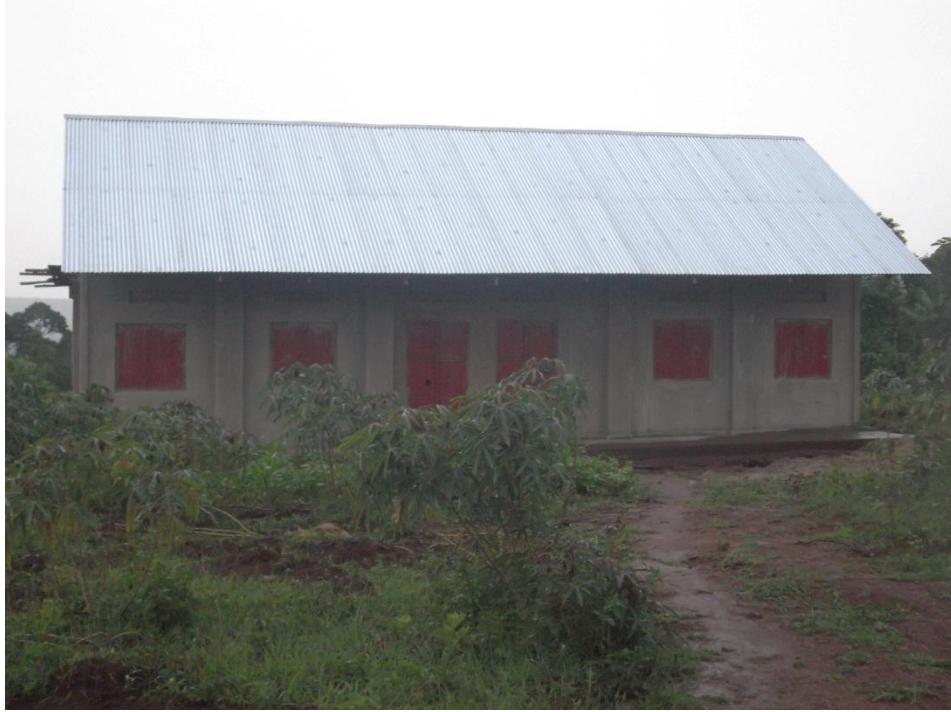
The front part of the completed two classrooms.