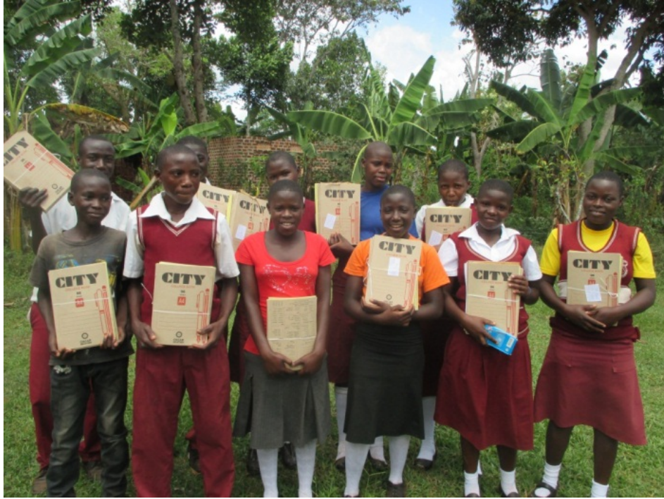
Najja Educational Centre students with their exercise books.