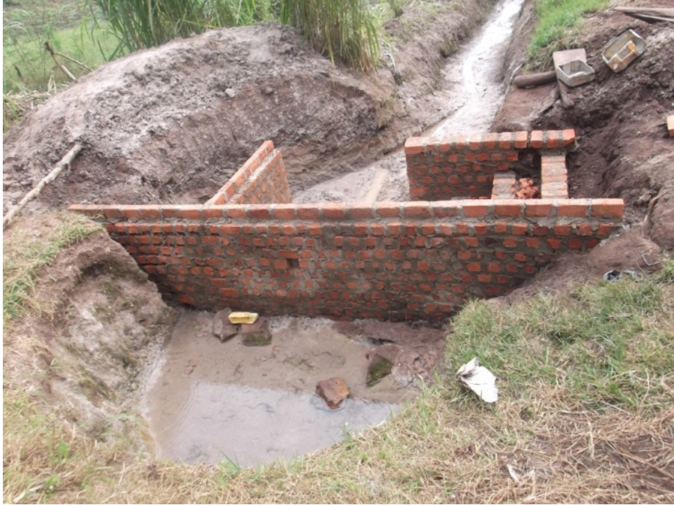
Water source being constructed