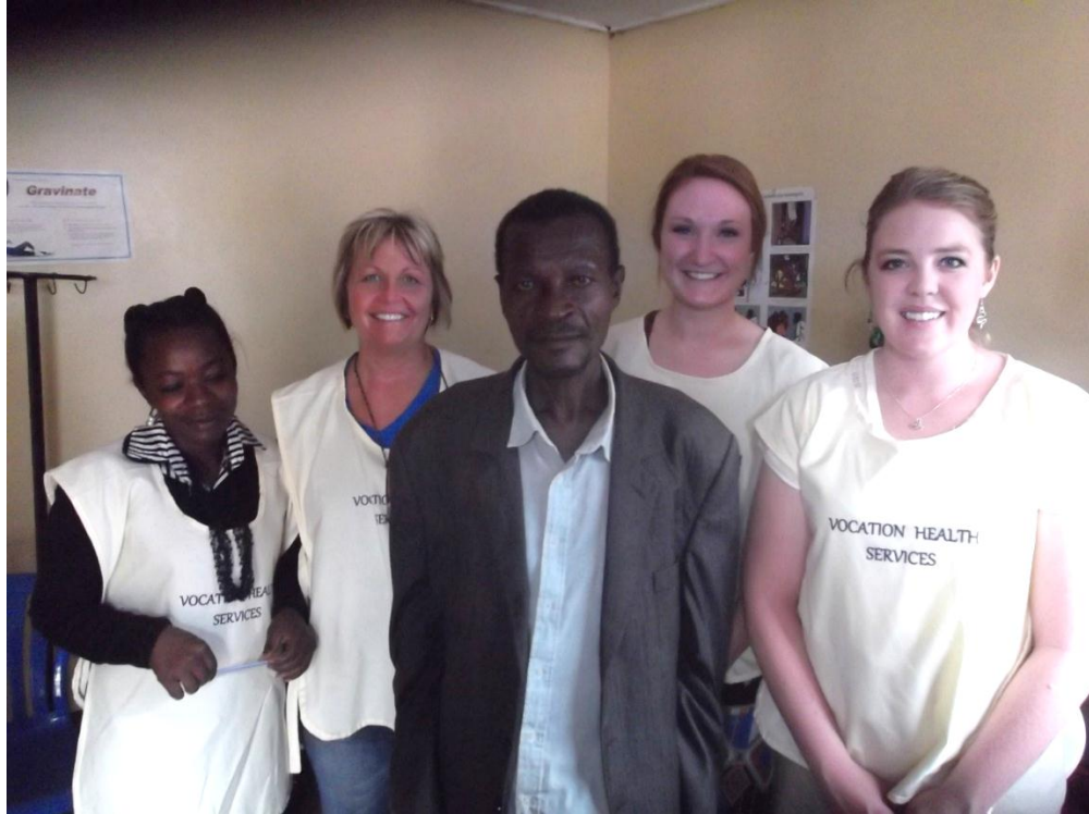
Some medical volunteers with a patient