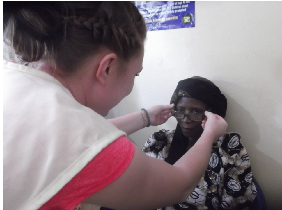
An eye patient trying the suitable reading glasses