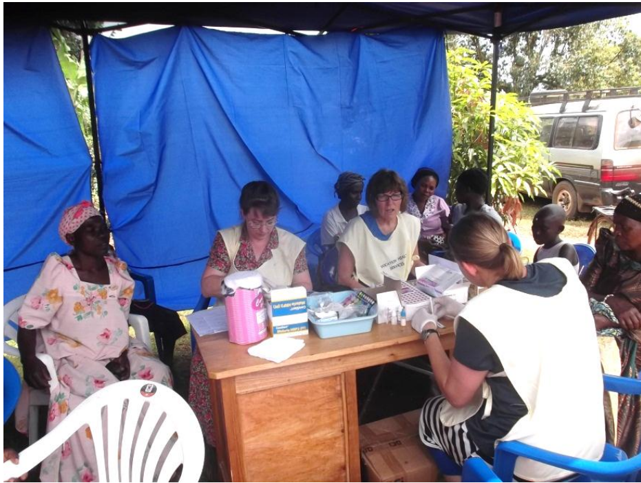
Testing blood of the patient