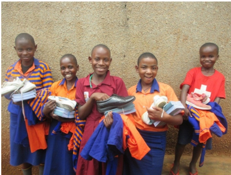
Little Angels Primary School pupils very happy with their scholastic materials.